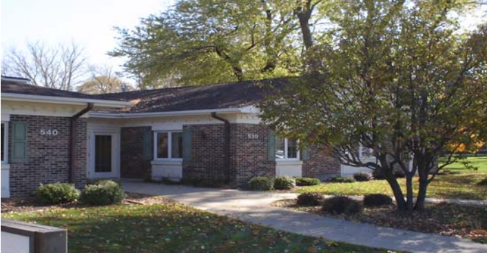
An outside look at the new office